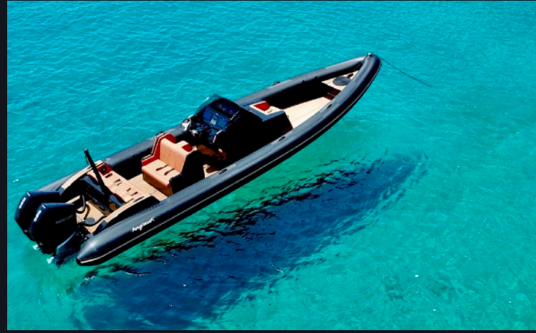
Large consoles with leaning post and rear bench