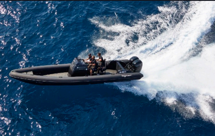
Sport console with Ullman seats