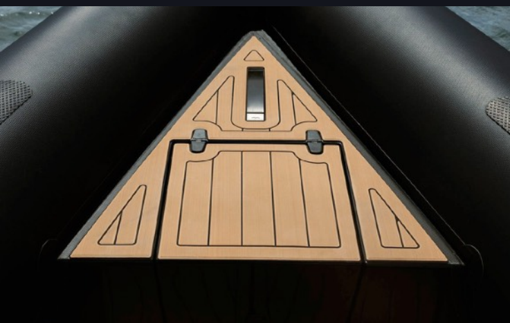
EVA Foam Floor