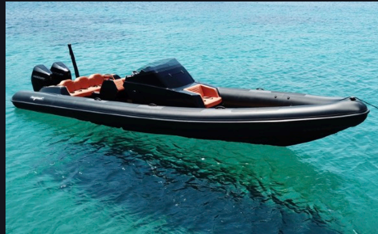
Anti slip attachments and handles on tube