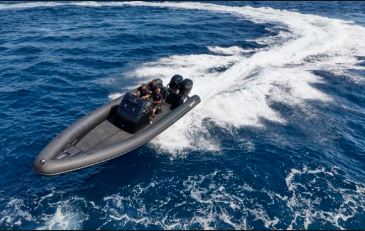
Sport console with anti slip GRP floor